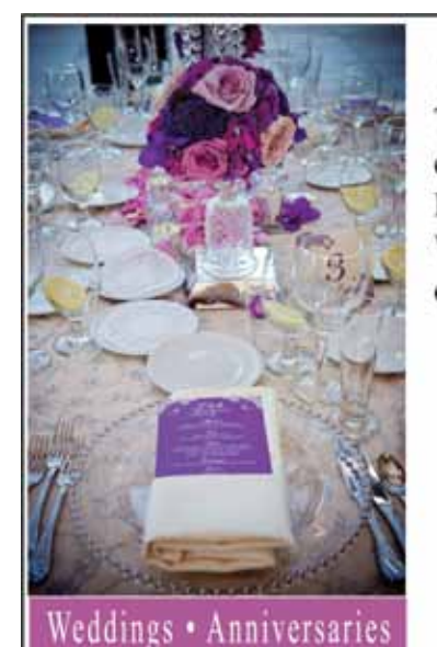
(Watch for complete details in upcoming editions)

June 1st- June 4th • Lincoln & Leland Ave.