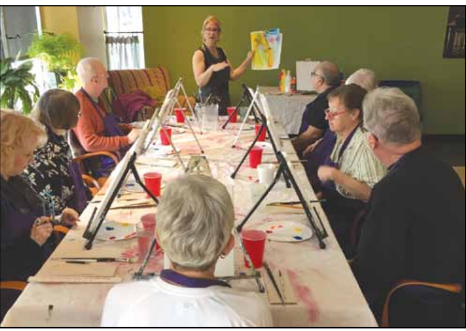
Customers at Mather's—More Than a Café get creative in the popular Paint with Val art class.

music; at Mather's on Higgins Avenue we schedule some dinner theater events with special menus tied to live entertainment."