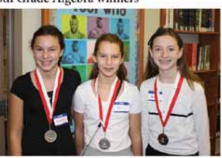
7th Grade Algebra winners