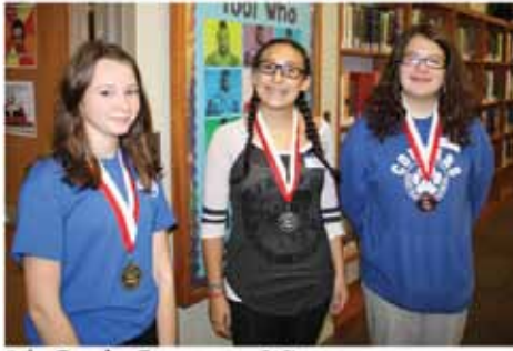
8th Grade Geometry Winners