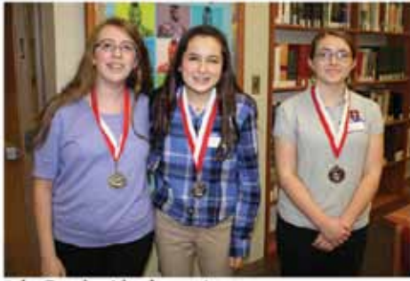
8th Grade Algebra winners