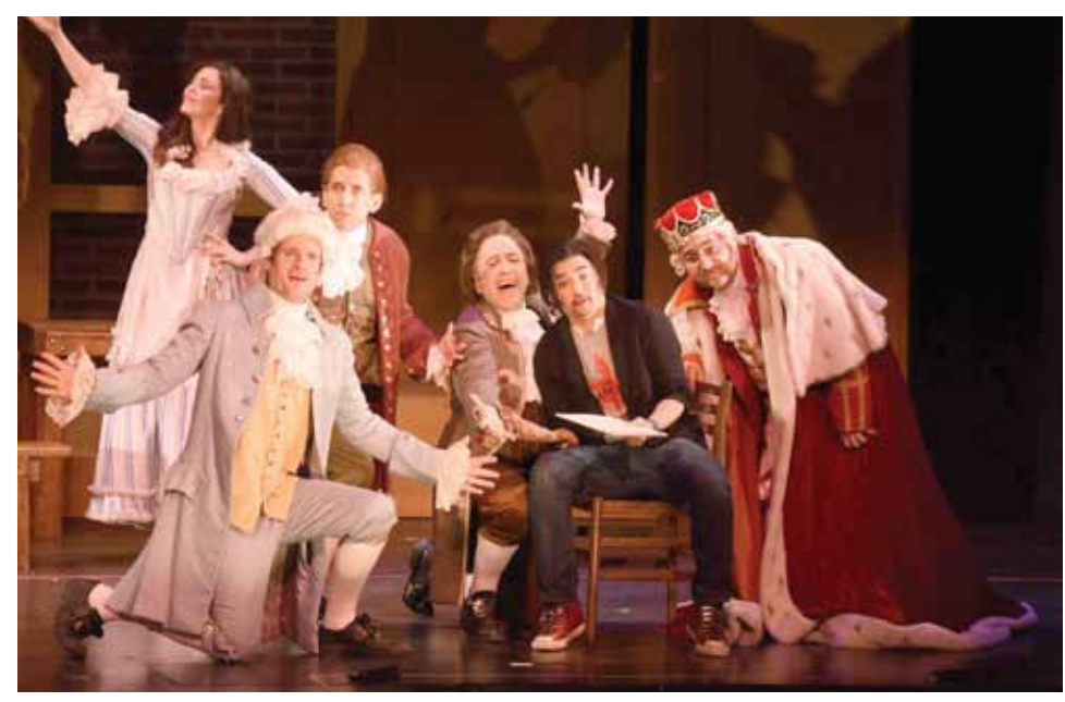
The Chicago Bar Association's 93rd annual bar show "This Case is a Shamilton". Held December 1-4 at the Merle Reskin Theatre in Chicago, a holiday tradition, in which local attorneys utilize their acting talents and parody the year's most headlining local and national political, sports, and showbiz figures.