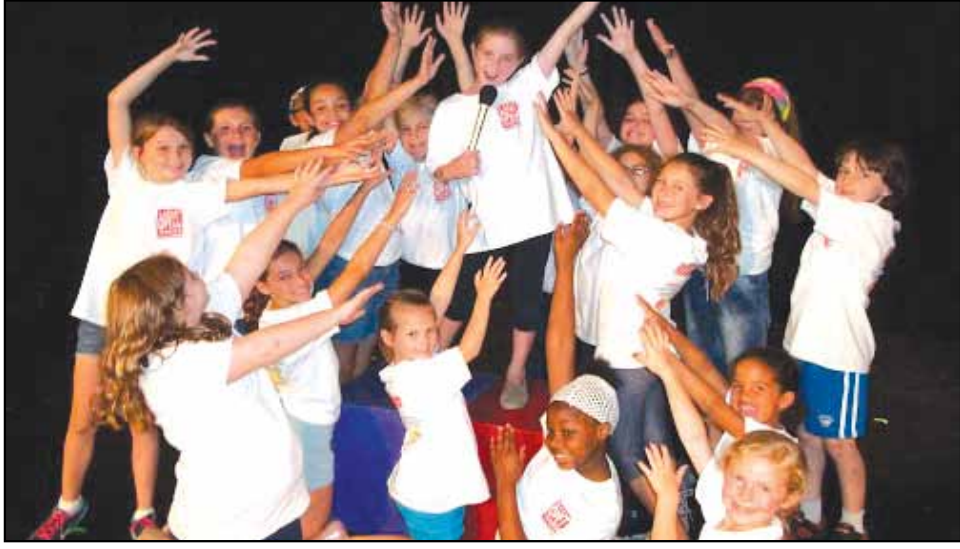
The Music Theater Works (formerly Light Opera Works) Musical Theater Summer Workshops give kids 8 to 13 the chance to sing, dance and act in a fun, nurturing atmosphere.

Five separate one-week workshops will be offered in 2017, each based on a popular musical. Each workshop is Monday through