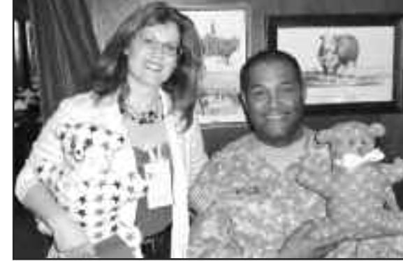
Bears volunteer with active Army serviceman

McCormick and Schmick's Seafood Restaurant, Skokie, held its Annual Veterans Appreciation Event on Sunday, November 13, 2011. Bears of Hope joined the restaurant to pay tribute to veterans for their service to our nation. McCormick & Schmick's, gave veterans a complimentary entrée and Bears of Hope gave them handmade patriotic fabric bears. Bears of Hope, a