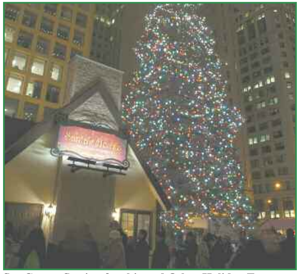
See Center Section for this and Other Holiday Events.