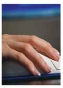
Se Habla Español.