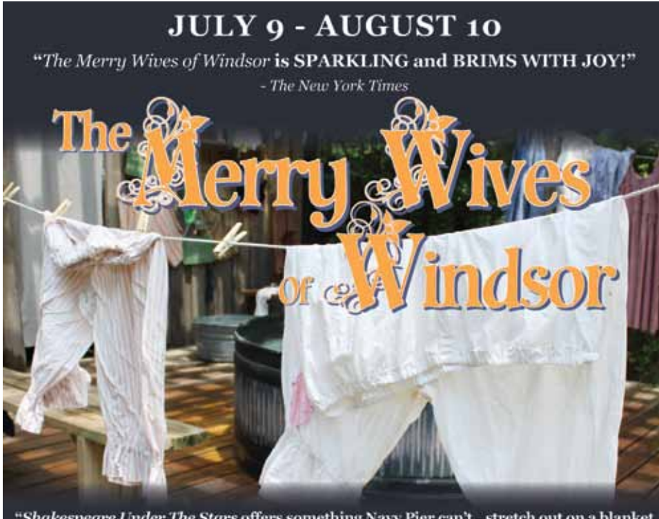
"Shakespeare Under The Stars offers something Navy Pier can't...stretch out on a blanket [...] while being transported to Shakespeare's OTHERWORLDLY ROMANCE." - Chicago Tribune